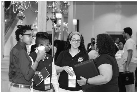
MANRRS Conference: Graduate students networking at the 31st Annual MANRRS Conference in Jacksonville, FL.

cal affiliation. Each of these laws prohibits a variety of discriminatory practices. As a career cluster in career and technical education, agriculture classrooms should often mimic and simulate the world of work. One way to prepare stu-