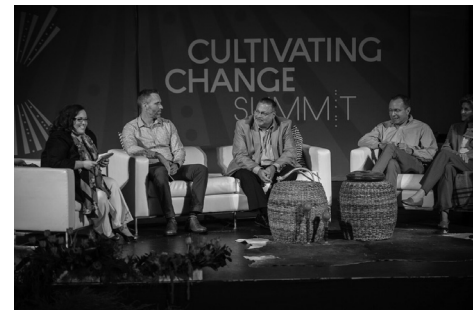
Panel Discussion: The Cultivating Change Summit Fireside Chat Panel Discussion showcased agricultural companies and organizations who are working to increase the visibility of diversity and inclusion in the agriculture industry.

liefs, and experiences. It’s not enough to say we think diversity and inclusion is a good idea, but students should also be equipped and prepared to be supervised by, work alongside, or supervise people who are culturally different from themselves. How do you provide this type of preparation for students?